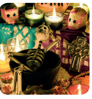
Day of the Dead